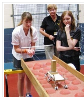
The winning "Mission to Mars" space buggy

Well done to all the students who participated.